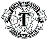
TABLE TOPICS CONTEST