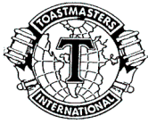
TABLE TOPICS CONTEST